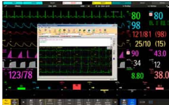
Access previous ECGs from Philips TraceMasterVue or other ECG management systems.