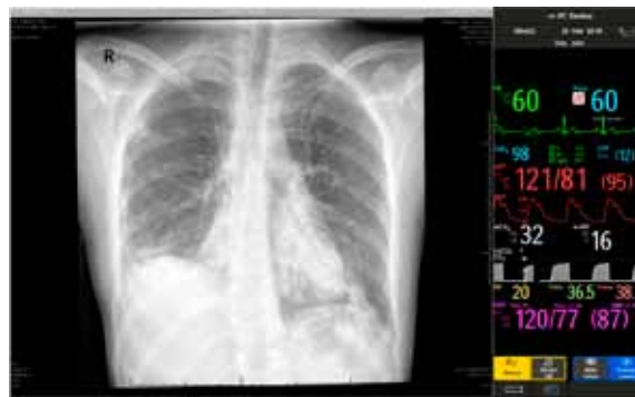
Leverage relevant information from your PACS.