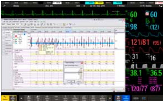
Show patient flow sheet from critical care information system (Philips ICIP).