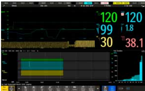
Car seat testing, recommended by the American Academy of Pediatrics, helps clinicians to assess neonates' ability to safely tolerate the car trip home.